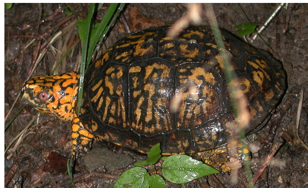
Box turtle in Baker Preserve

Please join the Athens Conservancy! www.athensconservancy.org