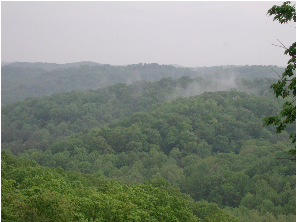
Vista from Longview Crossing on the Mythical Tree Trail