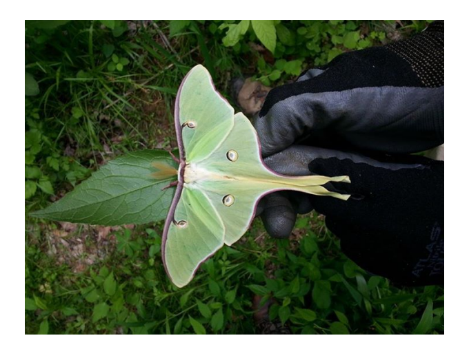
Luna moth in Baker Preserve

Some of the trail names may arouse curiosity. Liar's Ridge Trail refers to the tall tales told by some members of the trail crew while building it. The Mythical Tree Trail refers to a large fallen trunk that was blocking that trail when its route was initially planned, the size of which grew to mythical proportions in the minds of those who were going to have to cut it eventually. When finally cut, it turned out to be less impressive than imagined during the months of procrastination. Four pieces cut from the trunk remain along the trail as seats for hikers. Cockatiel Ridge refers to an incident in 2008 when an Ohio University student doing a project for a botany course saw a Cockatiel in the trees, lured it down, and caught it. Not wanting to keep it herself, she took it to a pet shop a few miles away, which it turned out was the place the bird had escaped from days earlier. The famished Australian bird, unable to feed itself in the wilds of Ohio, eagerly returned to its cage and gorged itself.