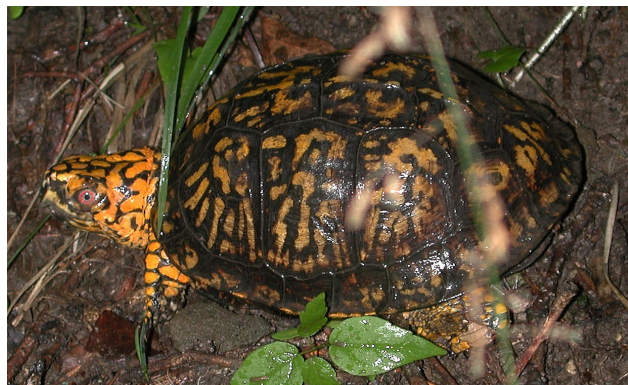
Box turtle in Baker Preserve