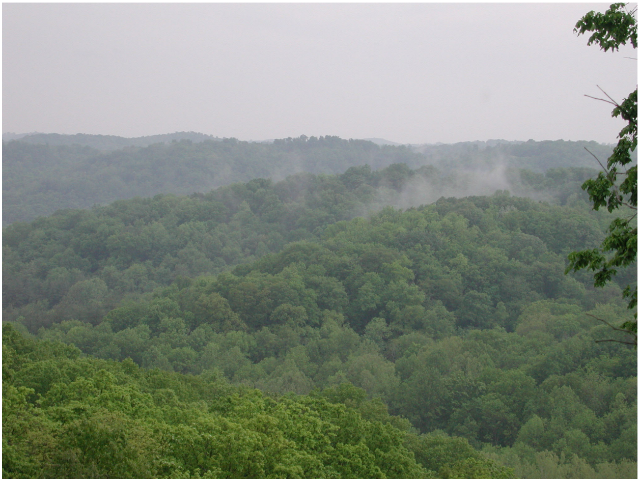
Vista from Longview Crossing on the Mythical Tree Trail