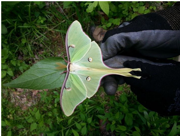
Luna moth in Baker Preserve

Some of the trail names may arouse curiosity. Liars Ridge Trail refers to the tall tales told by some members of the trail crew while building it. The Mythical Tree Trail refers to a large fallen trunk that was blocking that trail when its route was initially planned, the size of which grew to mythical proportions in the minds of those who were going to have to cut it eventually. When finally cut, it turned out to be less impressive than imagined during the months of procrastination. Four pieces cut from the trunk remain along the trail as seats for hikers. Cockatiel Ridge refers to an incident in 2008 when a Ohio University student doing a project for a botany course saw a Cockatiel in the trees, lured it down, and caught it. Not wanting to keep it herself, she took it to a pet shop a few miles away, which it turned out was the place the bird had escaped from days earlier. The famished Australian bird, unable to feed itself in the wilds of Ohio, eagerly returned to its cage and gorged itself.